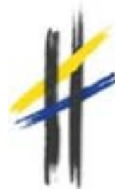
St Mark's Church Broomhill